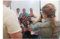
Students gathered for the annual photo event held by the Only Love organization.