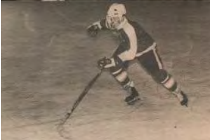
Nov. 13, 1979 A Pioneer hockey player skates on the ice while itching to score a goal.