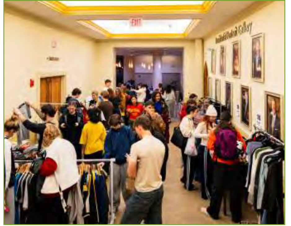
Students peruse the Bison Flea market on Friday, Nov. 7, 2025.